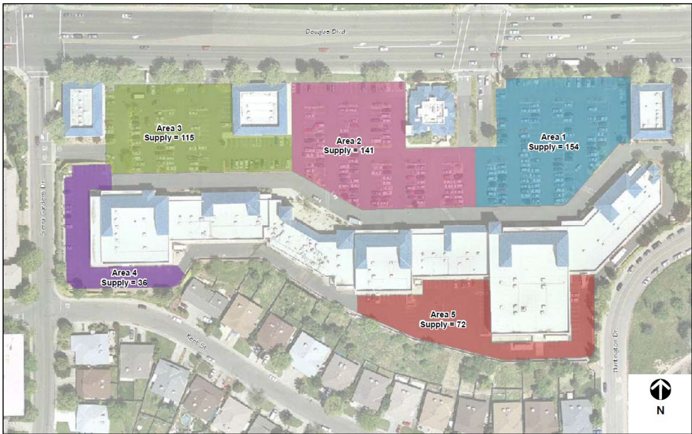
Figure 2: TJ Maxx Shopping Center Parking Study Areas

Staff had some concerns with the proposed use within Area 3 since Aqua Tots, an indoor swim instruction facility recently opened. Aqua Tots is considered a specialty school by the City’s Zoning Code and has a higher parking demand (30 spaces) than a traditional retail business. However, based on the parking analysis and the results of the original four (4) day parking utilization study and an additional five (5) days of data collection in late October and early November 2024, Parking Area 3 has sufficient available parking spaces to serve the proposed Ramen 101.